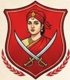
● Laxmi Bai House