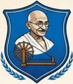
● Gandhi House