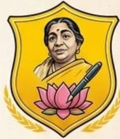
● Sarojini House

★ ★ ★ ✨ Celebrate Culture • Creativity • Team Spirit ✨