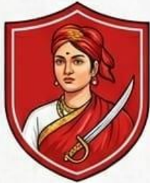
Laxmi Bai House